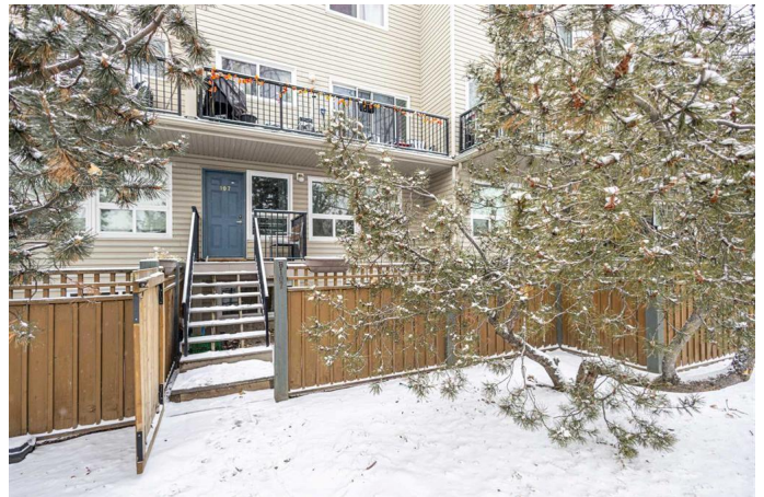
107-3615 49 St NW, Calgary, AB

Main Building: Total Exterior Area Above Grade 404.85 sq ft