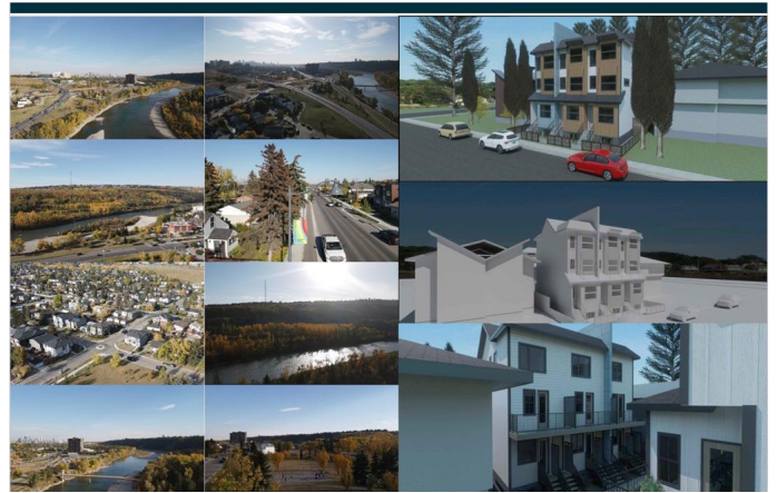
THE PLOT OF LAND : VISUALIZING YOUR NEXT PROJECT HERE

Seize this remarkable chance to acquire a prime MU-1 50 X 120 lot and bring your vision to life with the construction of the following Mixed-use building- a multi-story structure with commercial spaces on the ground floor and residential units above, creating a lively street atmosphere while addressing housing needs. Consider developing a series of townhouses or row houses, offering affordable options for families and individuals in a mixed-use setting. Live-work units- Design innovative spaces that blend residential living with commercial functions, perfect for professionals looking to operate a business from home. Small Retail or Office Space- Construct a boutique retail or office space to support local businesses, caf  s, or professional services, enhancing the community's economic landscape. Explore the possibility of creating facilities for community services, such as a daycare, community center, or health service center, that would greatly benefit local residents. Montgomery is a thriving neighborhood with an array of amenities just a short walk away, including shopping at Market Mall, a diverse selection of restaurants, and the scenic Bowness Park along the Bow River. Additionally, youâ€™ll have quick accessâ€™ whether by transit or vehicleâ€™ to the majestic Rocky Mountains, Canada Olympic Park, Winsport, the University of Calgary, and both the Childrenâ€™s and Foothills Hospitals. The area is experiencing a surge of new families and positive growth.