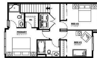
UPPER FLOOR PLAN = 653 SQ FT