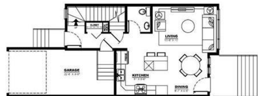
MAIN FLOOR PLAN = 537 SQ FT